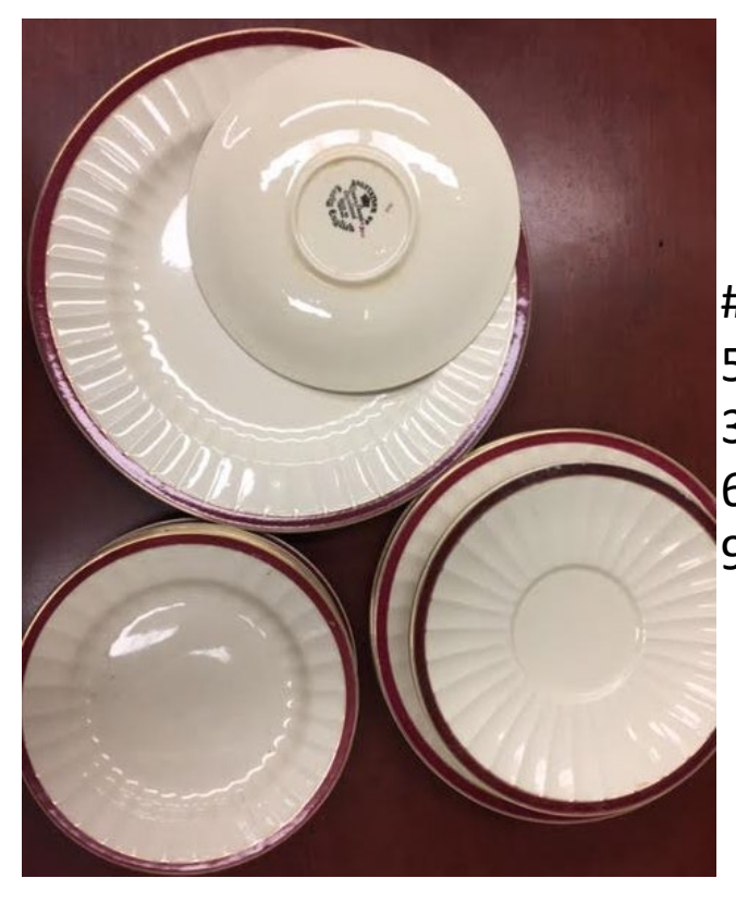
#13 Red-rimmed dishes: 5 10" Dinner plates, 3 8" Lunch plates, 6 6-3/4" saucers, 9 6-1/2" desserts