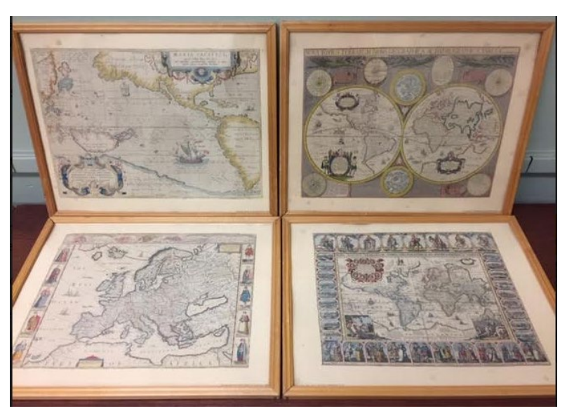
#1 Four 12"x14-1/2" Framed Maps