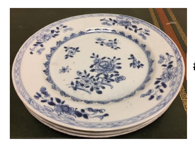
#47 3 Dinner Plates