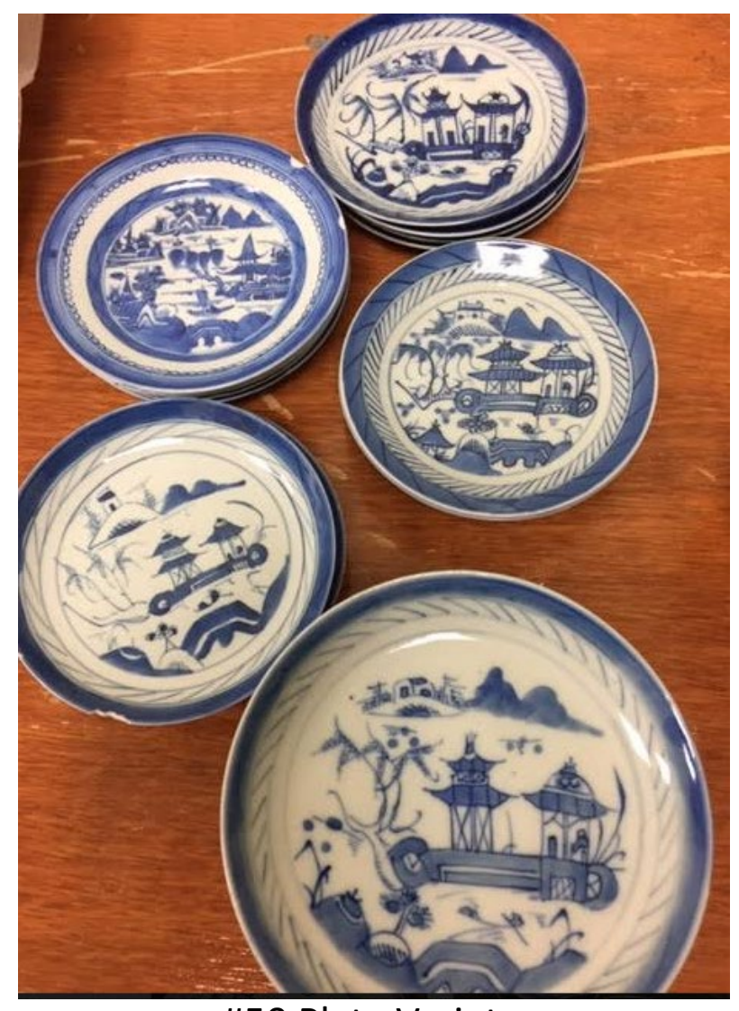
#50 Plate Variety