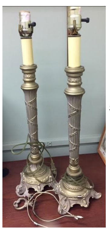
#3 Two Ornate Lamps 24" Tall