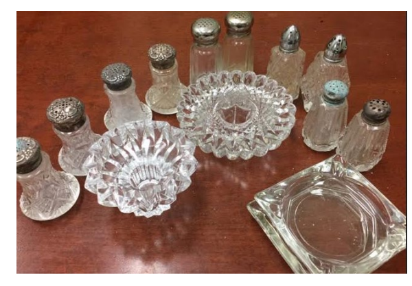
#32 Group of glassware