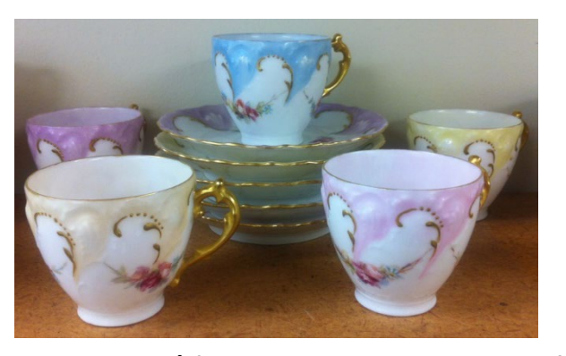
#15 Five Asst'd Demitasse Cups with 4-1/2" Saucers, French Rose Medalion