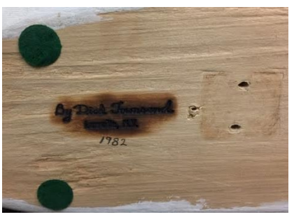
#11 Loon Signed, Dated 18-1/2" Beak to Tail