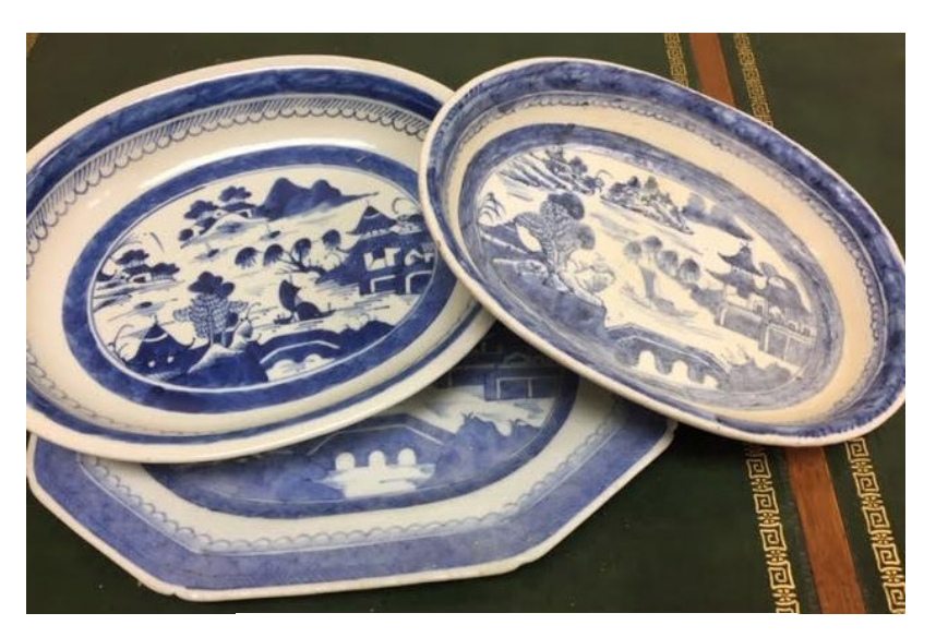
#53 Three Blue Platters