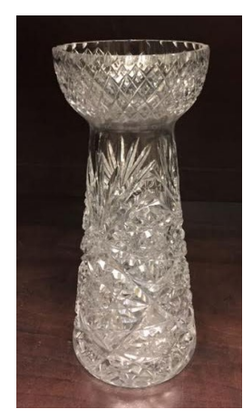
#21 Cut Vase 7" Tall