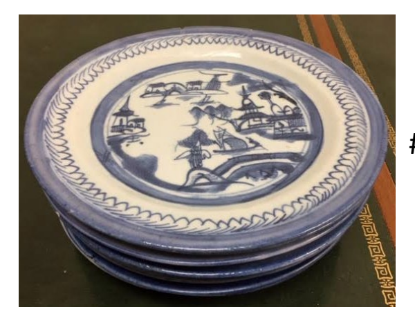
#49 4 Plates