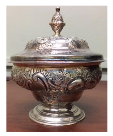
#38 Lidded Dish