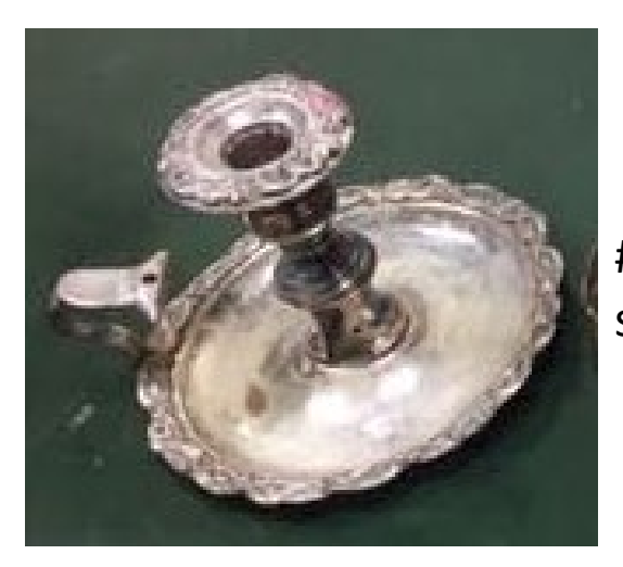
#19 Chamber Stick with snuffer missing 4" tall