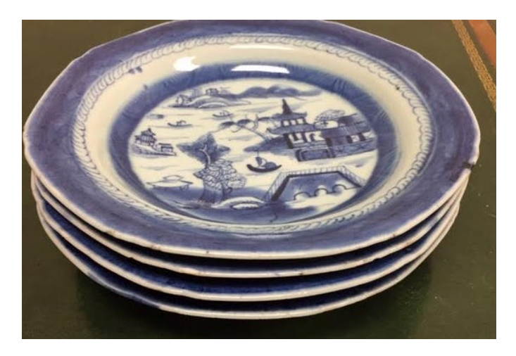
#51 Four Blue Plates