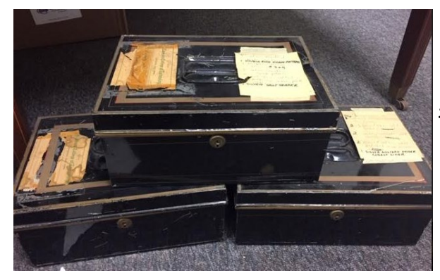
#5 Three Tin Boxes 8-1/4"x11-1/4"