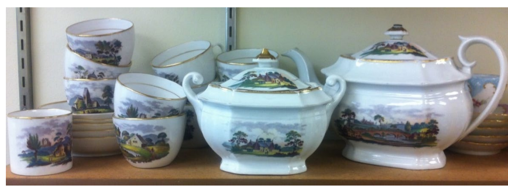
#14 Liverpool Transferware: 11 cups, 5 5-1/2" saucers, 1 coco cup, teapot with lid, sugar bowl with lid