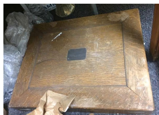
#7 Empty Silverware Box "Anna E Gardner"