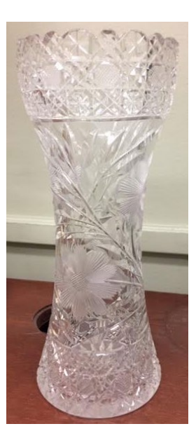
#29 10" Cut Vase There are 2 of these #30 10" Cut Vase There are 2 of these