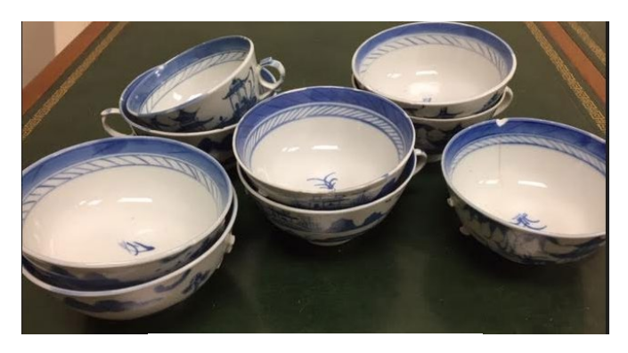
#52 Cup Variety