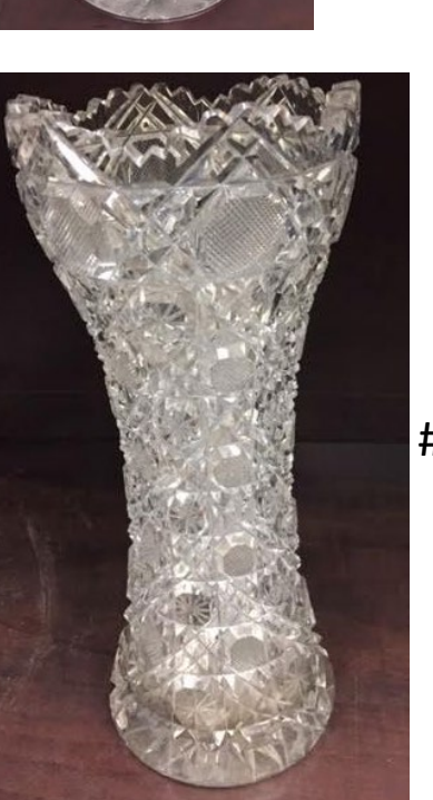
#28 9-3/4" Cut Vase