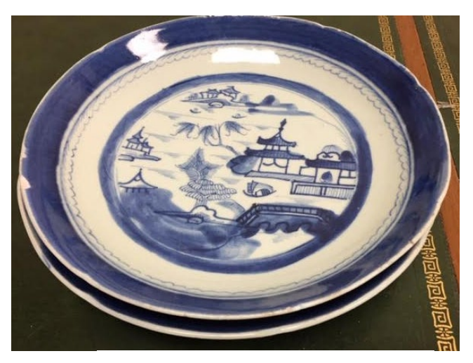
#54 Two Dinner Plates