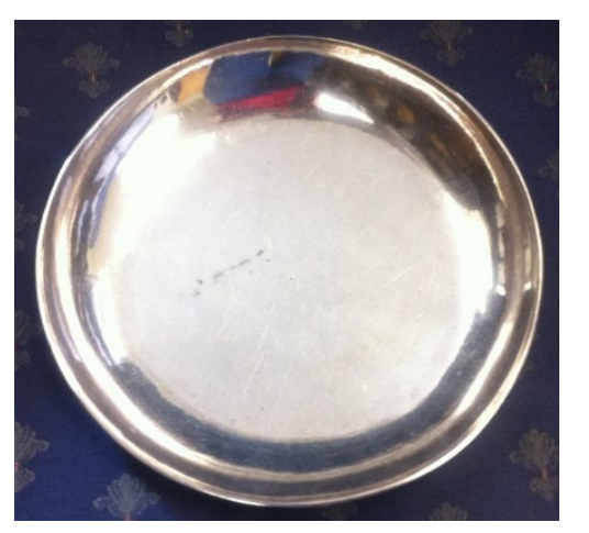
#20 Silver Bowl 9" plain