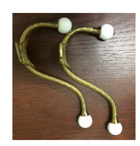
#10 Hooks 7-1/2"