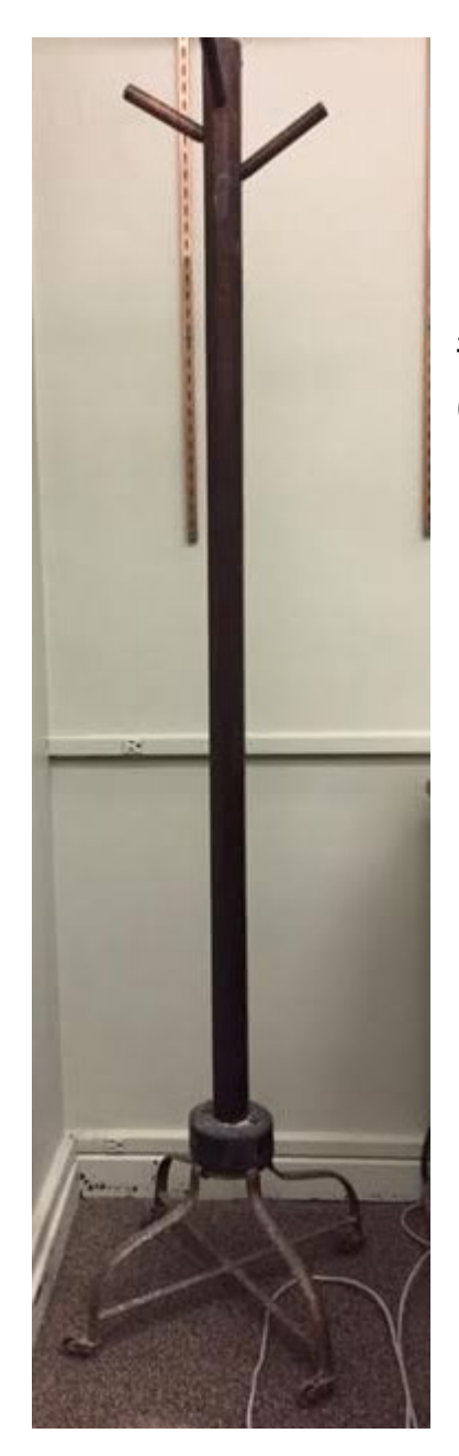
#44 Antique Coat Rack