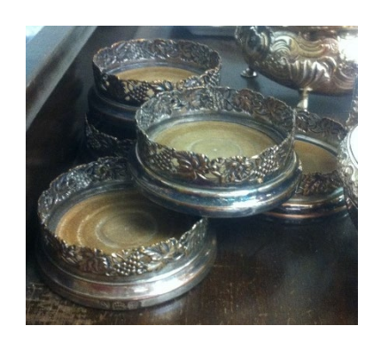
#18 Five Silver Coasters: grape design 3"