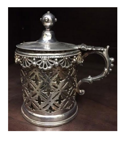
#35 Mustard Jar with Lid