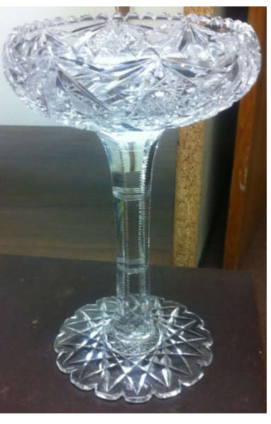
#25 Cut Stemmed Dish 9" Tall