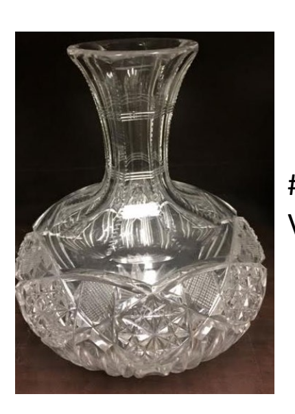
#24 Cut Squat Vase 7-1/2" Tall