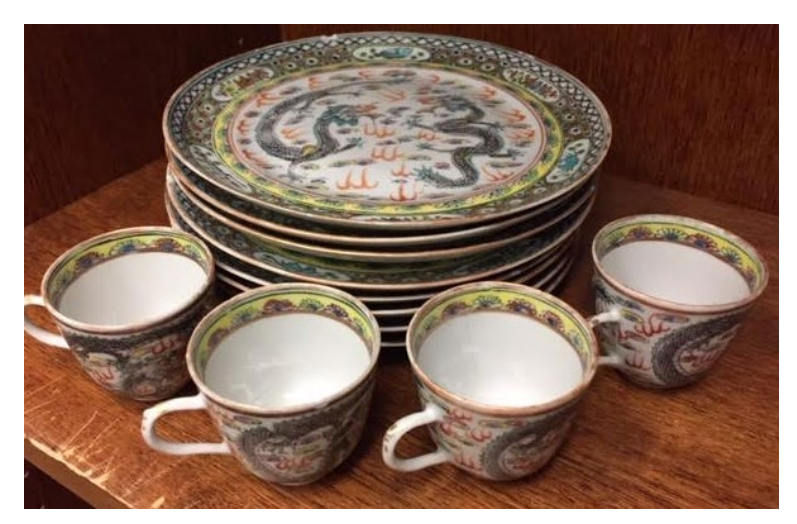
#39 8 Dragon 7-1/2" plates 4 demitasse cups