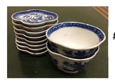
#48 Tiny Plates and Bowls