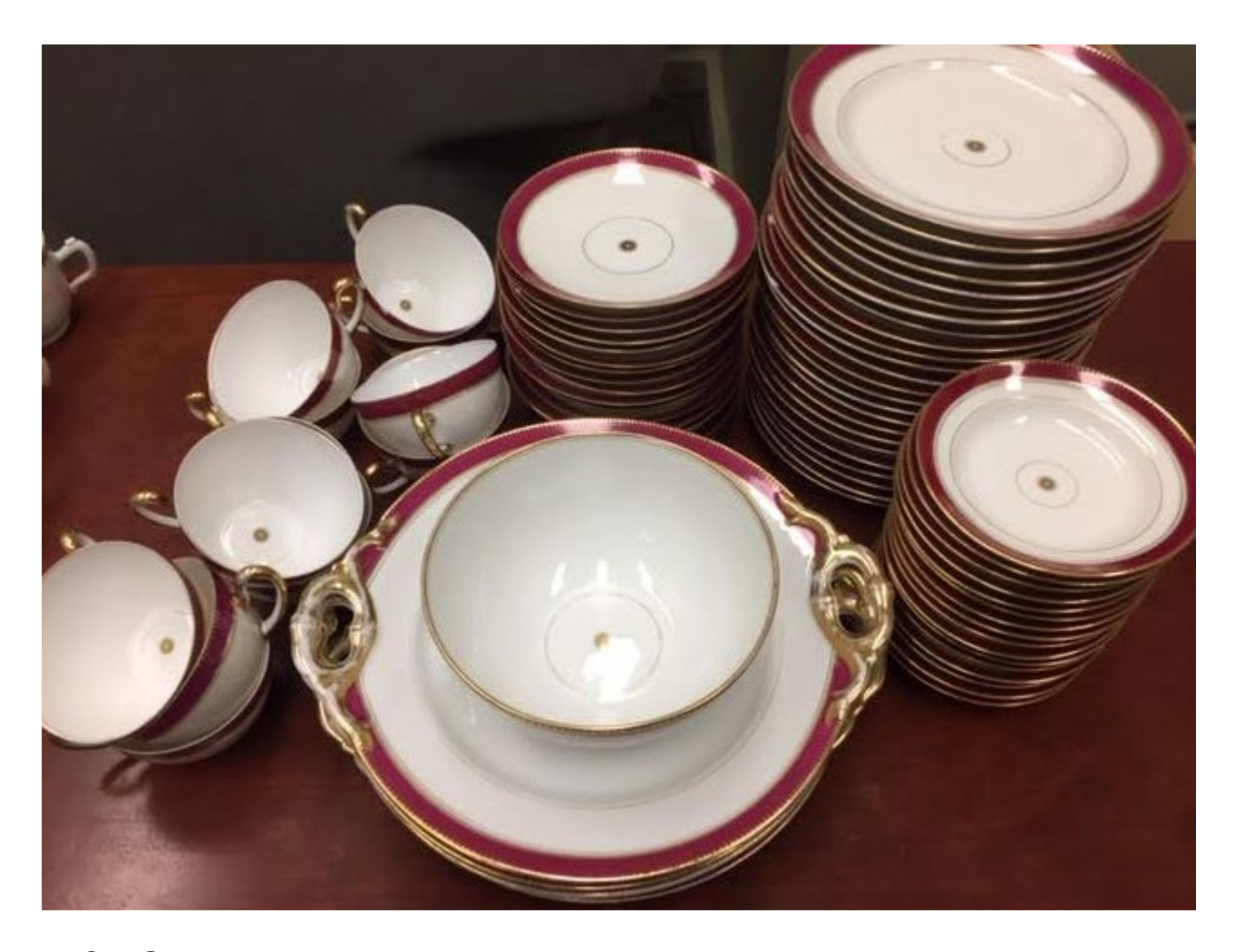
#34 Group: 12" vase, 4-3/4" bowl, 5-1/2" flower pot