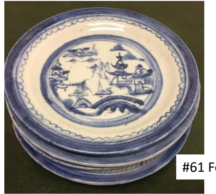
#61 Four Blue and White Plates