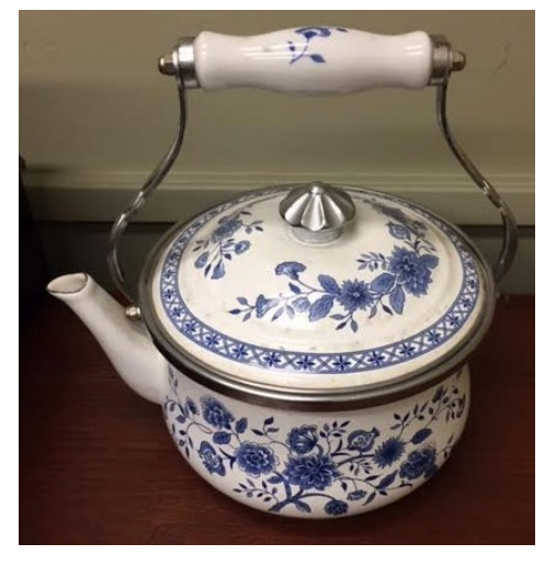
#6 Blue and White Tea Kettle 9" Tall