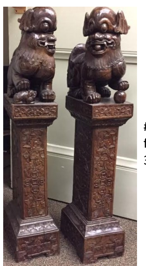
#12 Chinese Temple Dogs fireplace screen holders 32" Tall