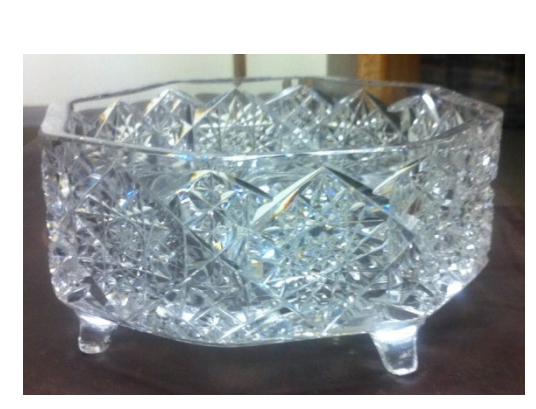
#23 Footed Fern Dish 4" Tall