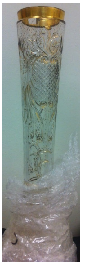
#31 21" Cut Vase with Gold Detailing