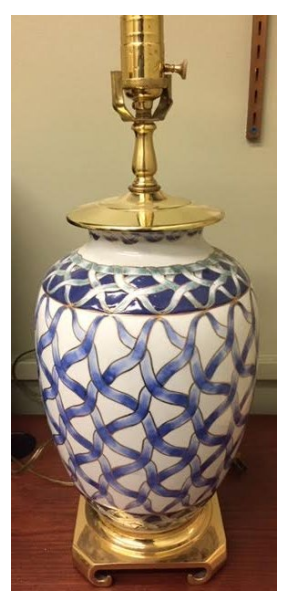
#4 Blue Ribbon Lamp 20" Tall