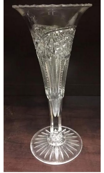
#26 Cut Vase 10" Tall