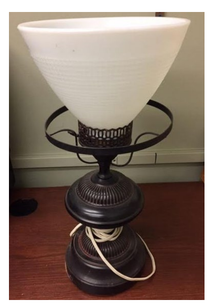
#2 Lamp 19" Tall