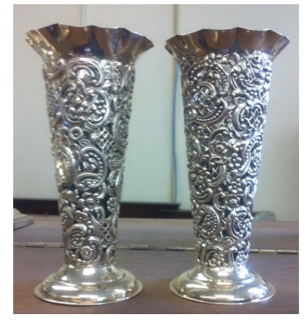
#37 Two Silver Pierced Vases with glass liners