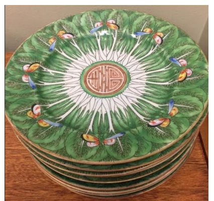
#43 Butterfly Dishes