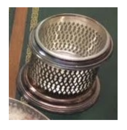
#17 Mustard Jar: silver plated pierced 3-1/2" tall