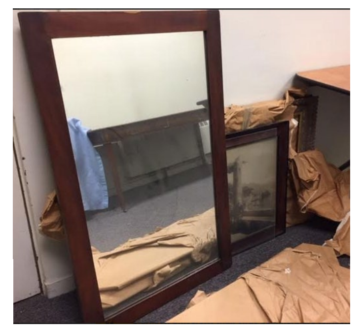
#46 Mirror and 2 Picture Frames