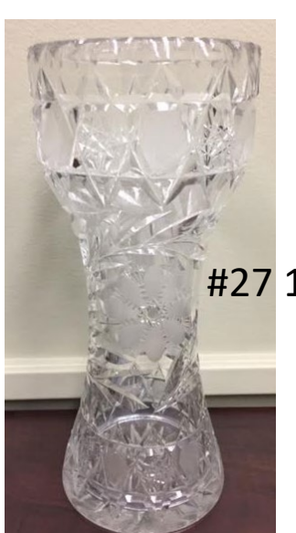
#27 12" Cut Vase