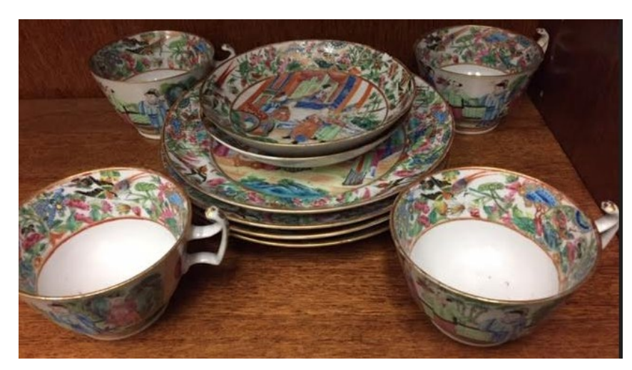
#40 Scene 4 7-3/4" lunch plates, 2 5-1/2" saucers, 4 cups4