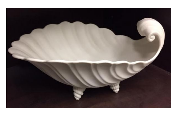
#16 Shell dish 8-3/4" long