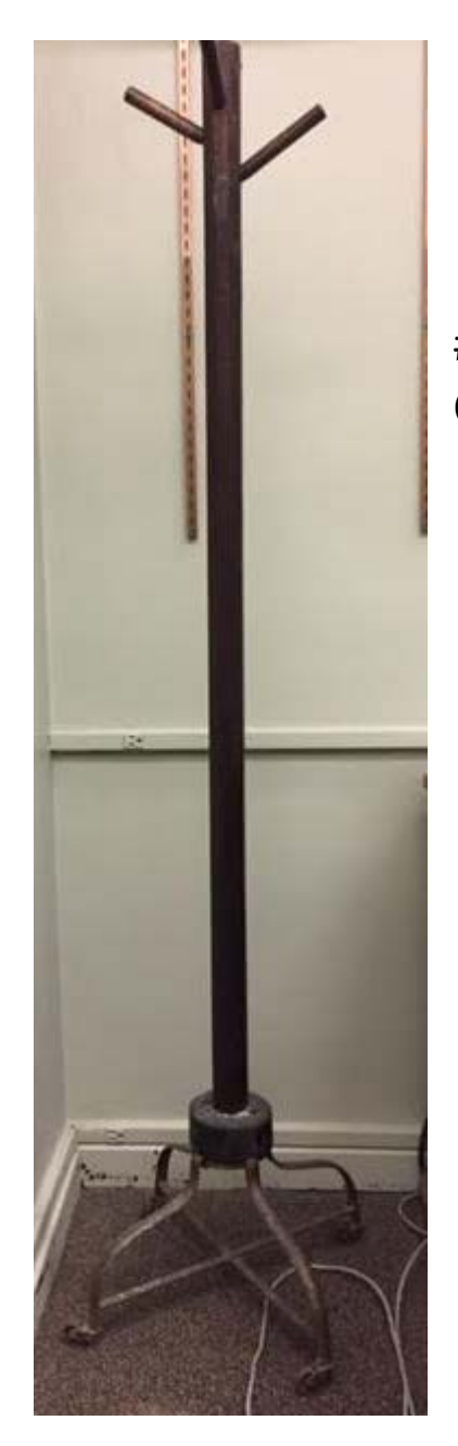
#44 Antique Coat Rack