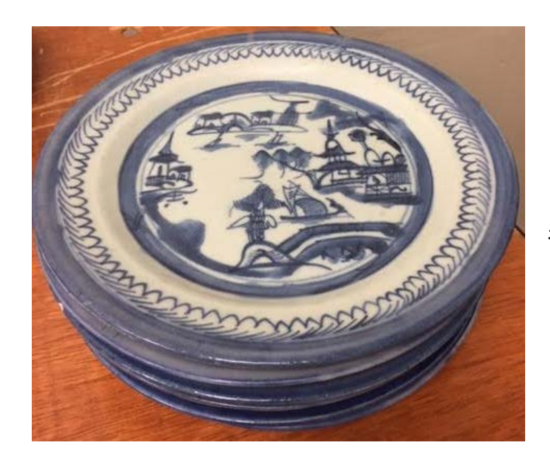
#67 Eight Plates