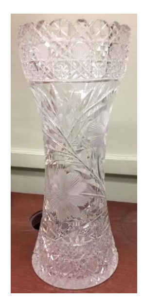
#29 Cut Vase 10" Tall

#30 Cut Vase 10" Tall (there are 2 of these being sold separately)