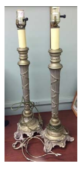
#3 Two Ornate Lamps 24" Tall