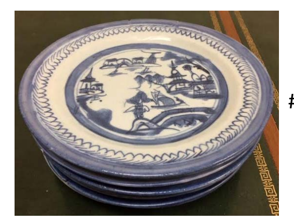
#49 5 Plate/Bowls