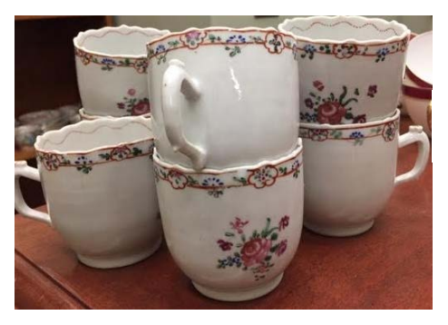
#65 Seven Demitasse with Rose