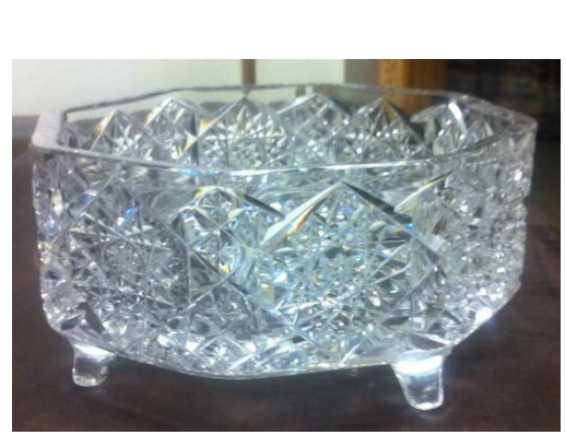
#23 Footed Fern Dish 4" Tall