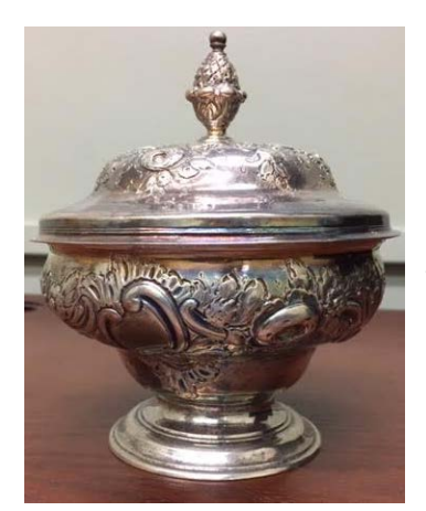
#38 Lidded Dish