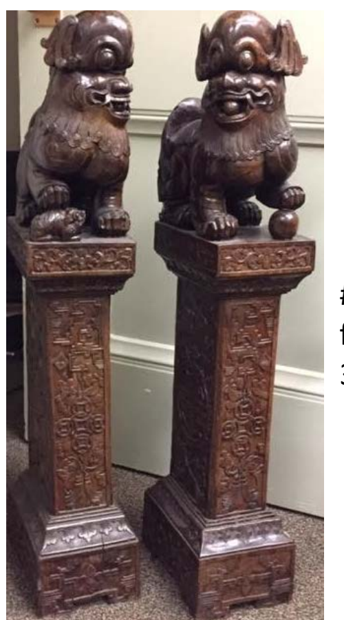
#12 Chinese Temple Dogs fireplace screen holders 32" Tall