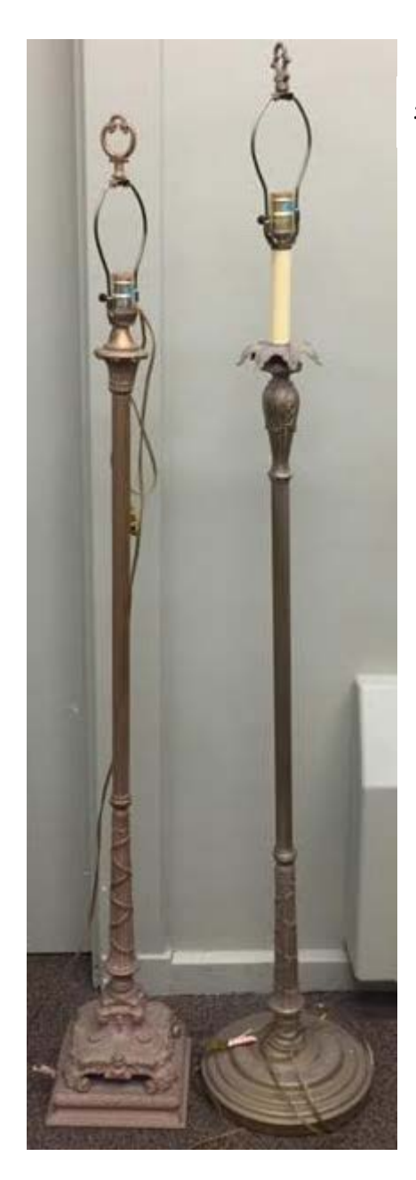
#63 Two Floor Lamps