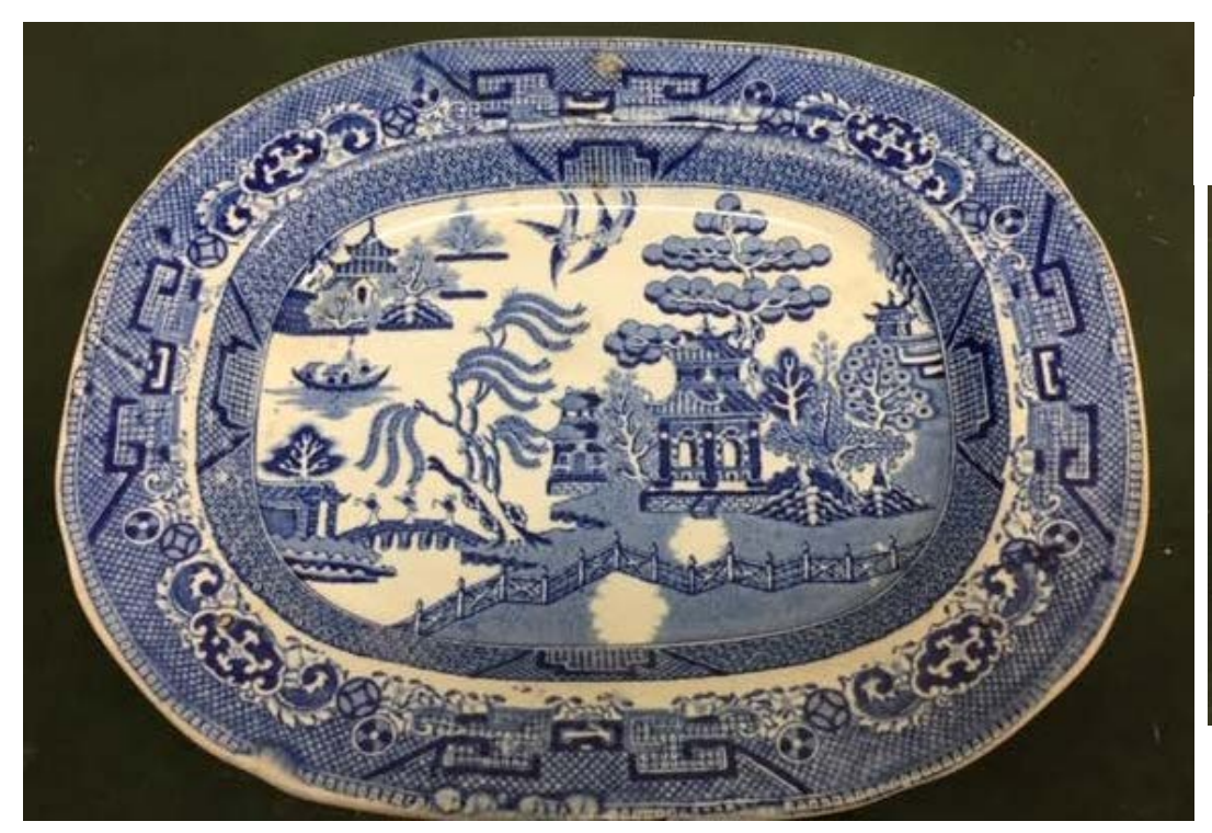
#62 Platter, 2 cups, rice bowl lid and plate