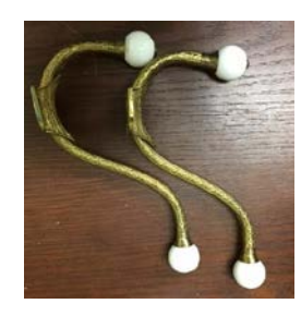
#10 Hooks 7-1/2"