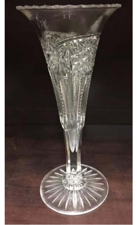
#26 Cut Vase 10" Tall