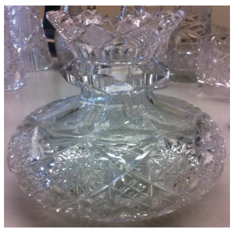
#22 Cut Squat Vase with Scalloped Edge 6" Tall