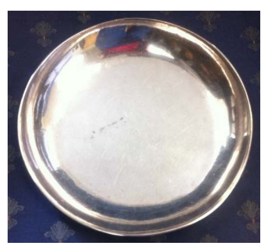
#20 Silver Bowl 9" Plain