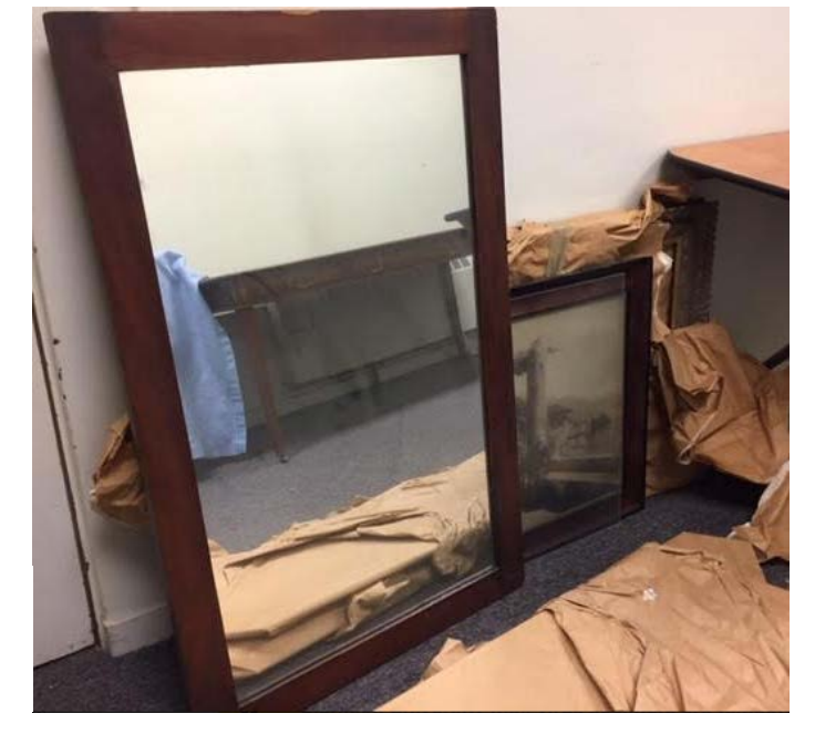
#46 Mirror and 2 Picture Frames