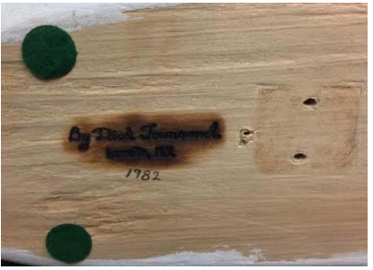
#11 Loon Signed, Dated 18-1/2" Beak to Tail