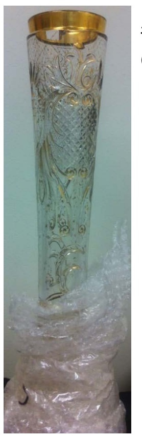
#31 Cut Vase with Gold Detailing 21" Tall