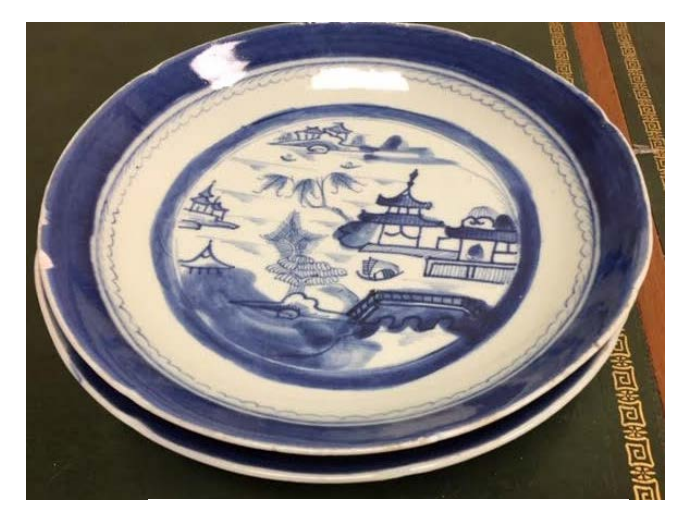
#54 Two Dinner Plates