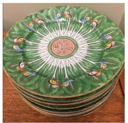
#43 Ten Butterfly Dishes