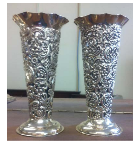
#37 Two Silver Pierced Vases with Glass Liners