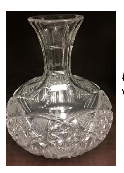
#24 Cut Squat Vase 7-1/2" Tall