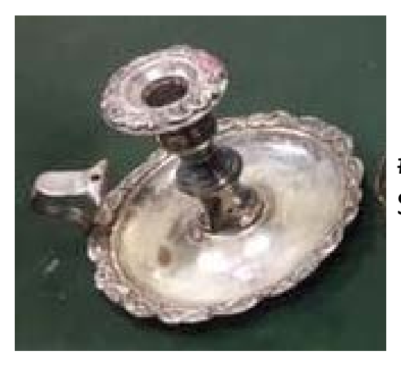
#19 Chamber Stick with Snuffer Missing 4" tall