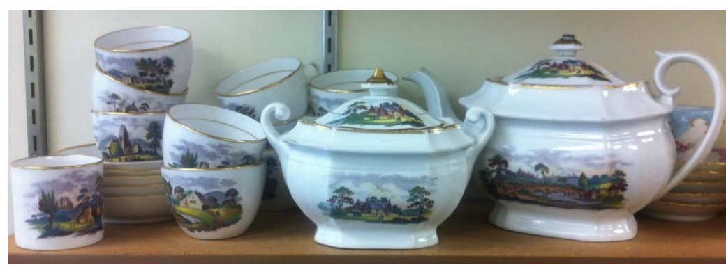
#14 Liverpool Transferware: 11 cups, 5 5-1/2" saucers, 1 coco cup, teapot with lid, sugar bowl with lid