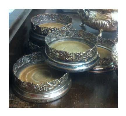
#18 Five Silver Coasters: Grape Design