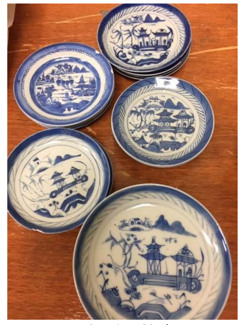
#50 Variety 23 Plates