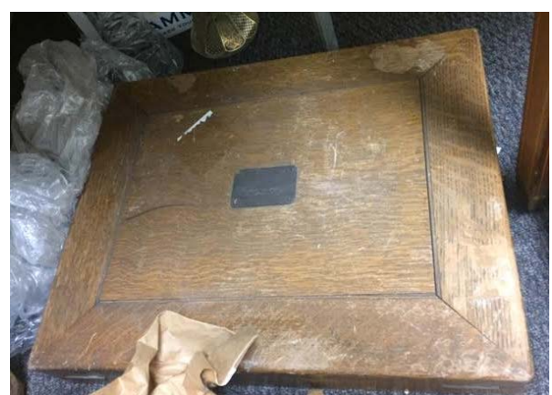
#7 Empty Silverware Box "Anna E Gardner"