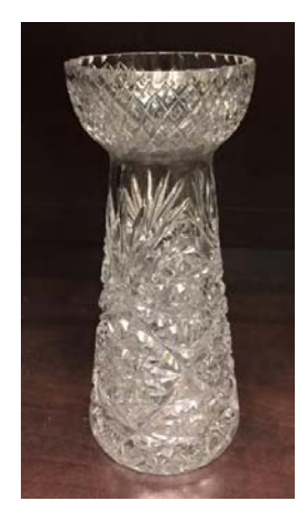
#21 Cut Vase 7" Tall