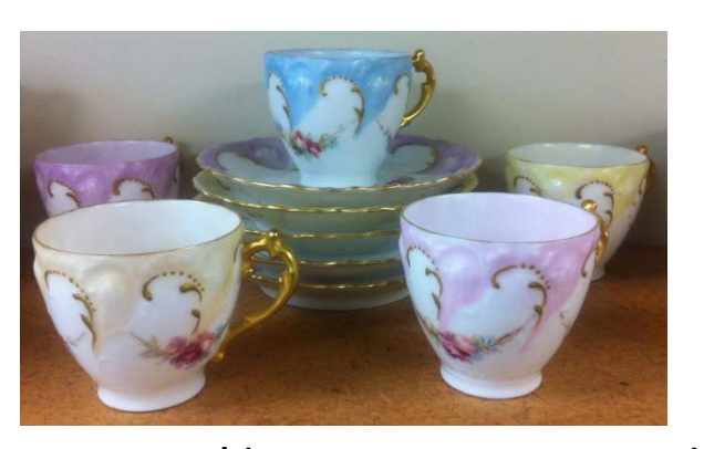
#15 Five Asst'd Demitasse Cups with 4-1/2" Saucers, French Rose Medalion