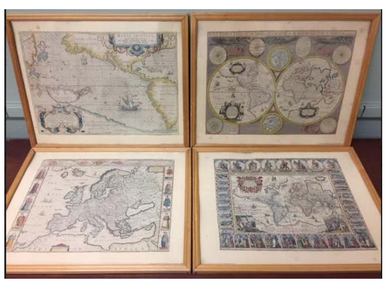
#1 Four 12"x14-1/2" Framed Maps