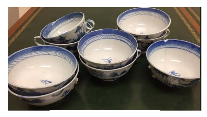
#52 Cup Variety