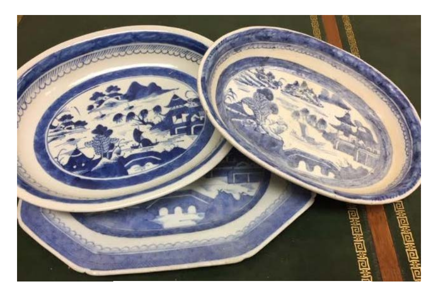
#53 Three Blue Platters