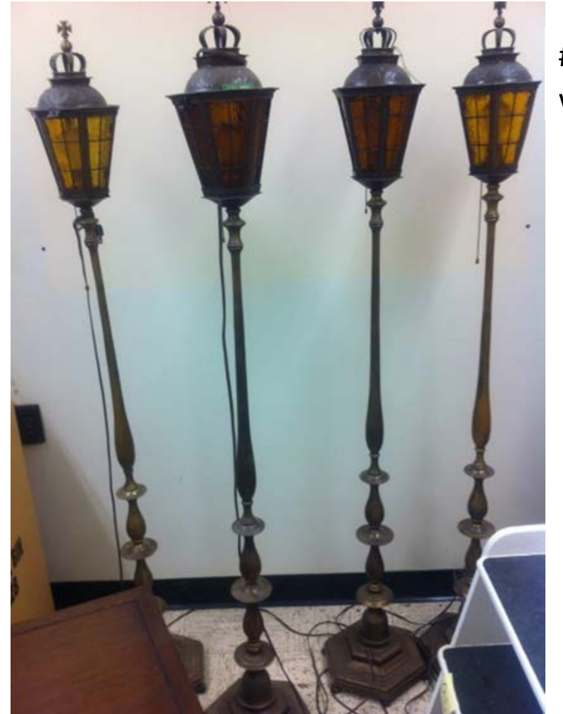
#45 Four Torchieres: Brass with Lantern Shades