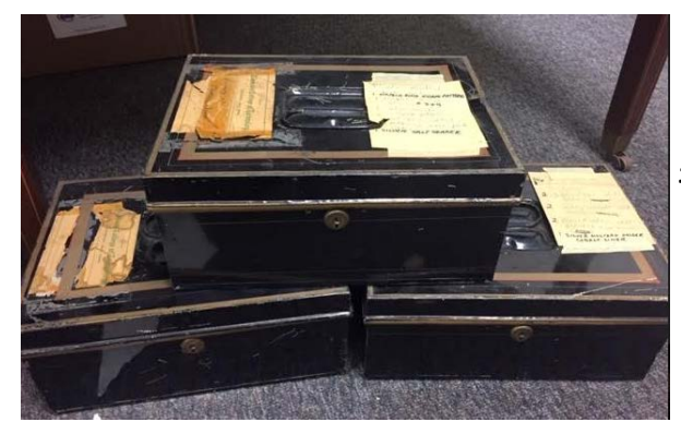
#5 Three Tin Boxes 8-1/4"x11-1/4"