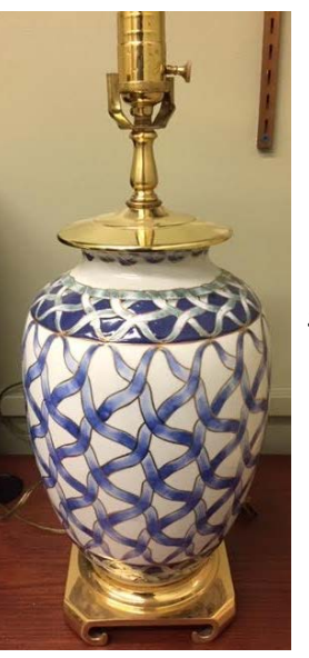
#4 Lamp Blue Ribbon 20" Tall