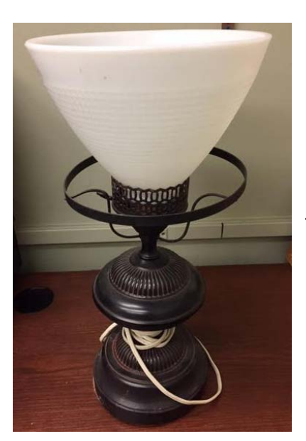
#2 Lamp 19" Tall