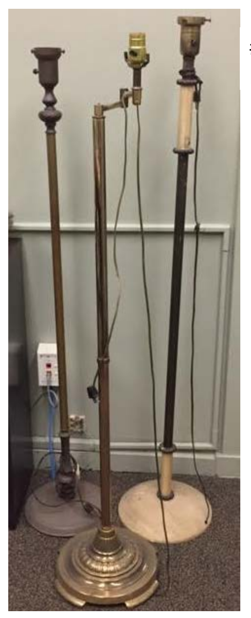
#64 Three Floor Lamps