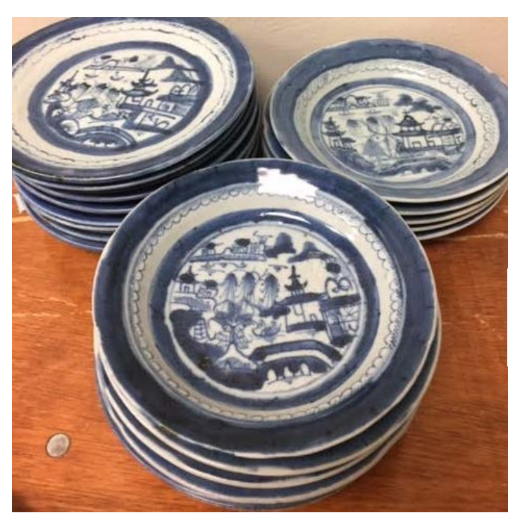
#66 Twenty-two Plate/Bowls