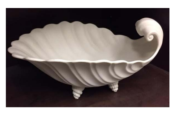
#16 Shell dish 8-3/4" long