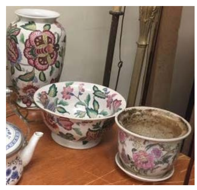
#33 Group: 12" Vase, 4-3/4" Tall Bowl, 5-1/2" Tall Flower Pot