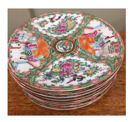
#41 Ten 8-1/2" Rose Medalion