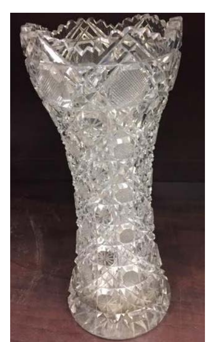
#28 Cut Vase 9-3/4" Tall

#30 Cut Vase 10" Tall (there are 2 of these being sold separately)