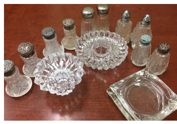
#32 Group of Glassware