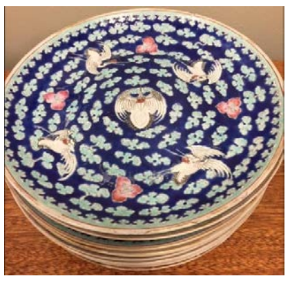
#42 Ten Blue with Crane