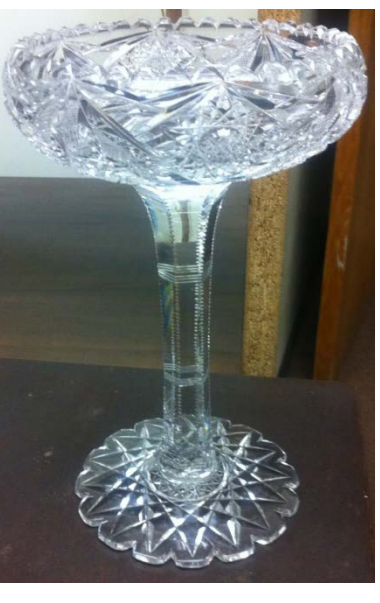
#25 Cut Stemmed Dish 9" Tall