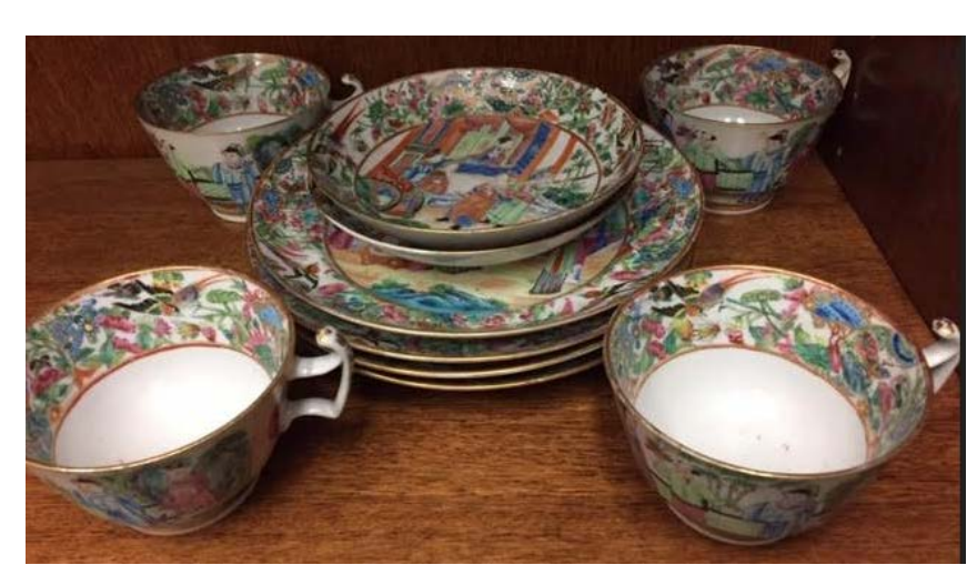
#40 Chinese Scene: Four 7-3/4" Lunch Plates, Two 5-1/2" Saucers, Four Cups