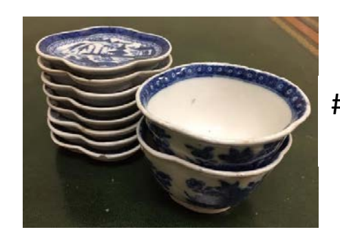
#48 Tiny Plates and Bowls